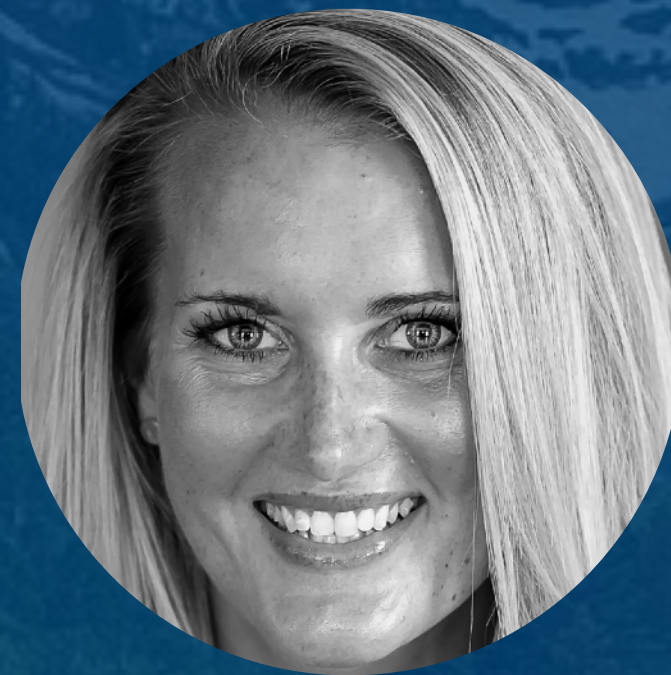
Whitney Daily SAP